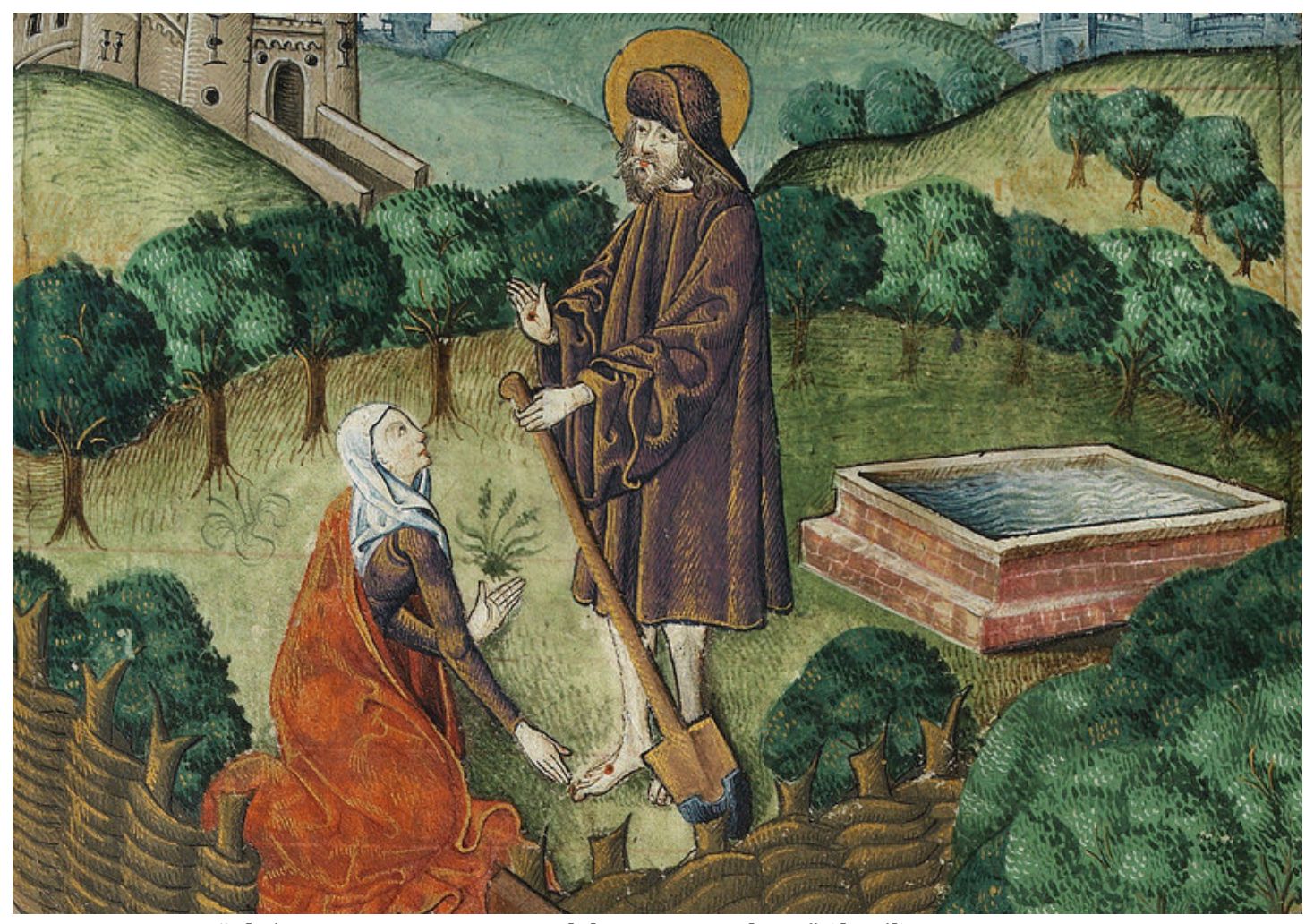
"Christ Appears to Mary Magdalene as a Gardener" (detail), ca. 1503–1504, England, National Library of Wales.

THE HOLY EUCHARIST IN CELEBRATION OF THE RESURRECTION OF OUR LORD JESUS CHRIST EASTER DAY, APRIL 20<sup>TH</sup>, 2025, 8:00 AM