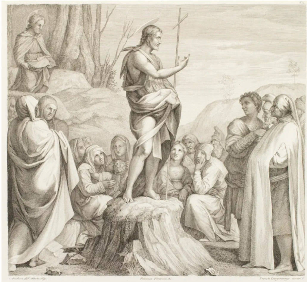
St. John the Baptist preaching to the multitude, Andrea del Sarto (1486-1530)

EMMANUEL EPISCOPAL CHURCH CELEBRATION OF THE HOLY EUCHARIST THE THIRD SUNDAY OF ADVENT DECEMBER 15 TH , 2024